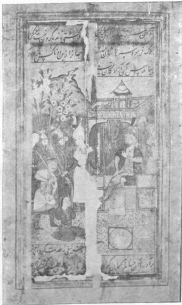
Illustration from a Persian Manuscript.