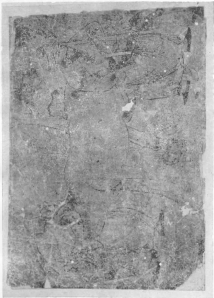
Persian drawing depicting the shoeing of a horse.