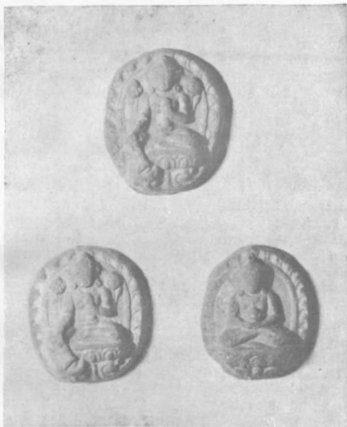
Terra Cotta Buddhist Images, from Indian Tibet.