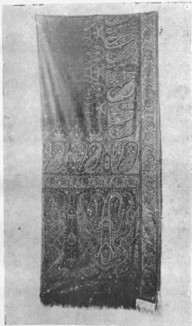
Embroidered shawl from Kashmir.