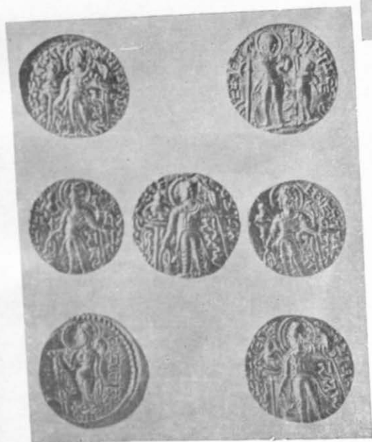
Gold coins of Guptas, including a mohar of Shah Shujah Durrani of Rikab Mubarik Mint.