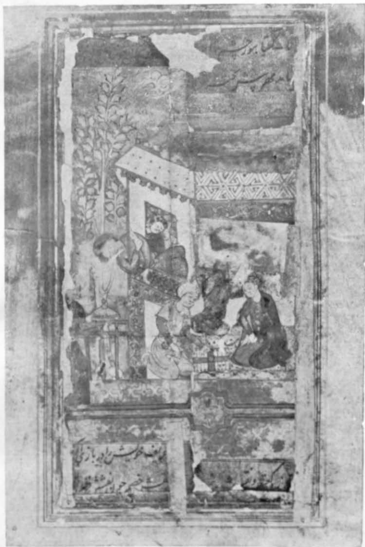
Illustration from a Persian Manuscript.