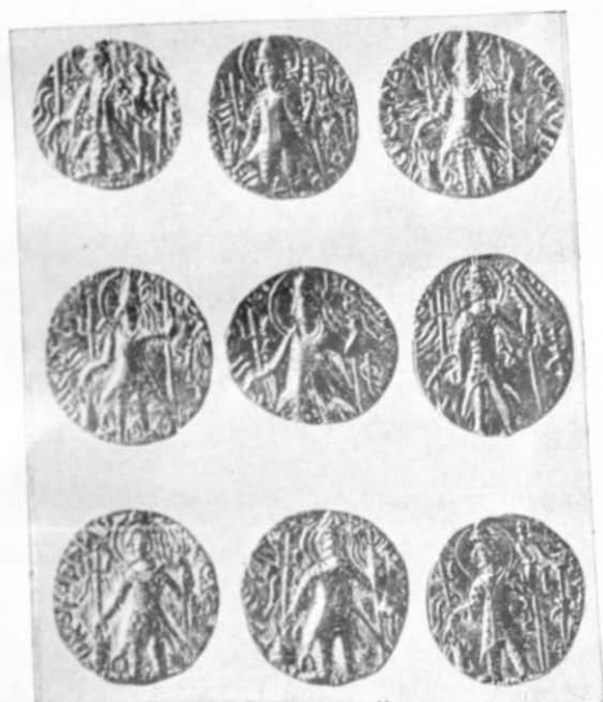
Gold coins of Guptas and latter Kushans.