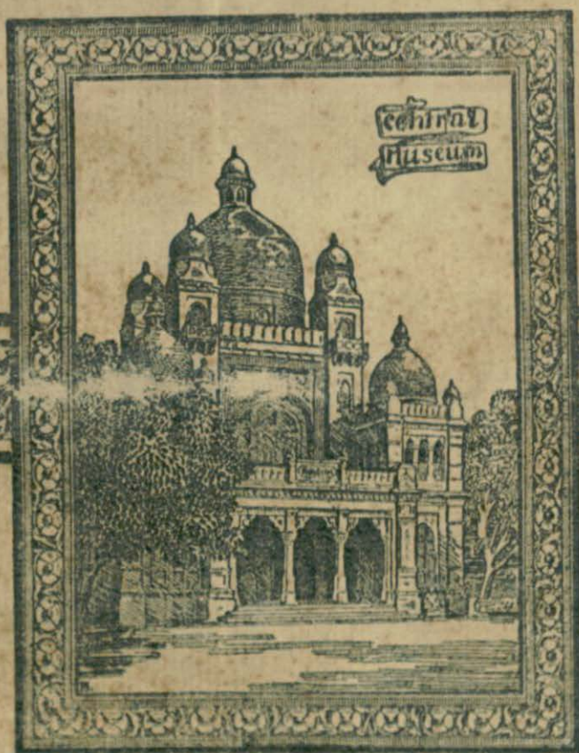
PROCESS DEPARTMENT 1916