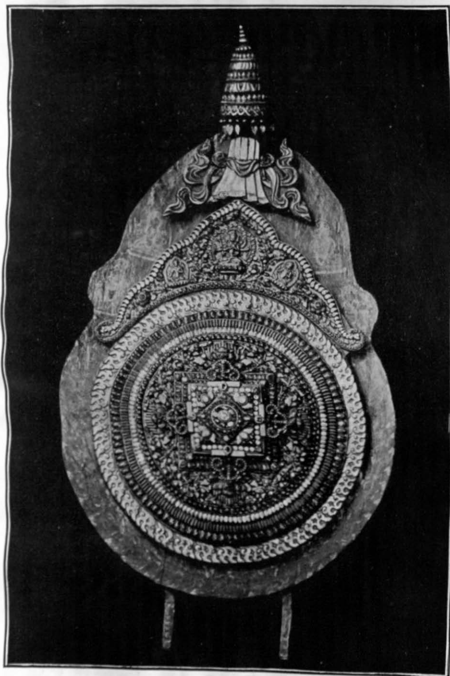
Nepalese Jewelled Dharmayantra.