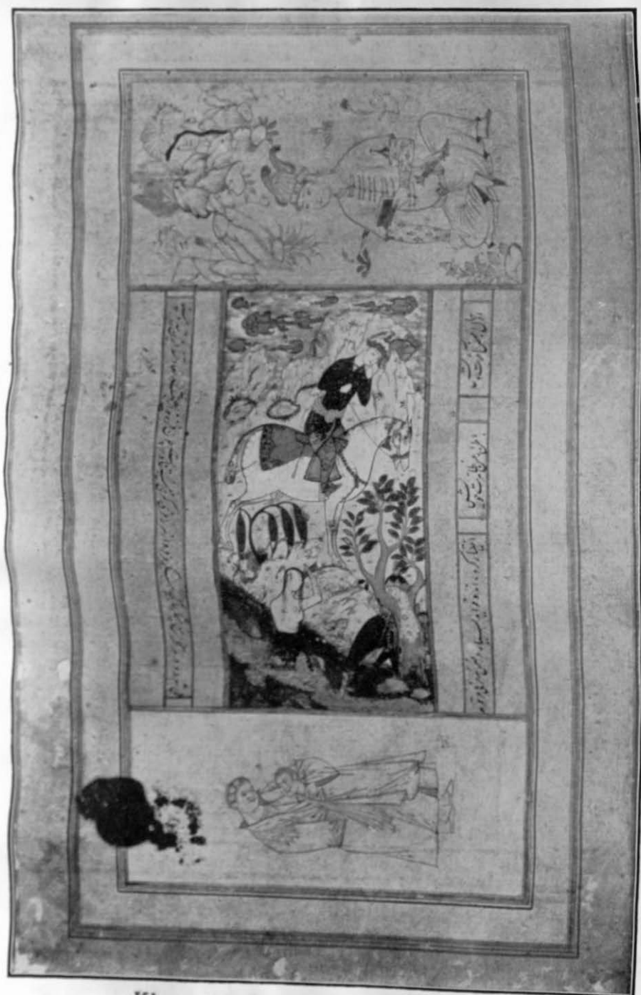
Khusrau looking at Shirin while bathing.