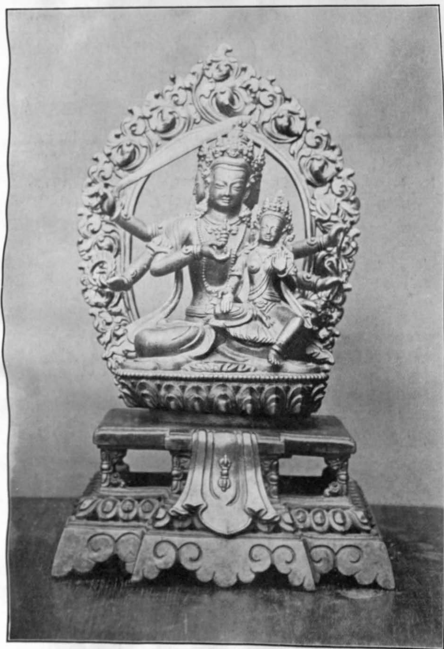
Manjusri and Sakti.