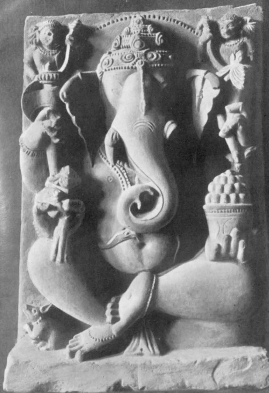
EKA DANTA GANAPATI.