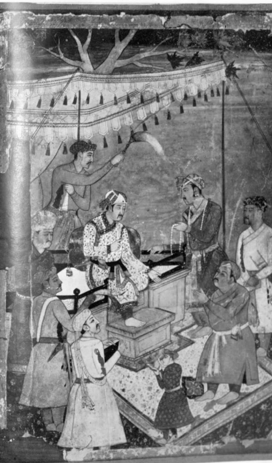
A MOGHAL PRINCE (AKBAR ?) IN DURBAR.