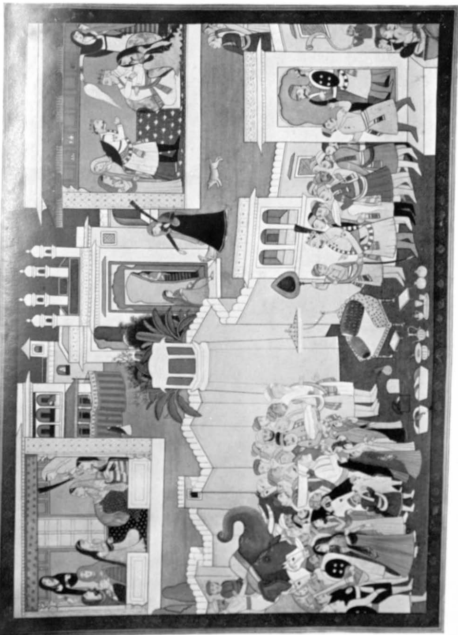
SCENE FROM THE AYODHYA KANDA OF THE RAMAYANA.