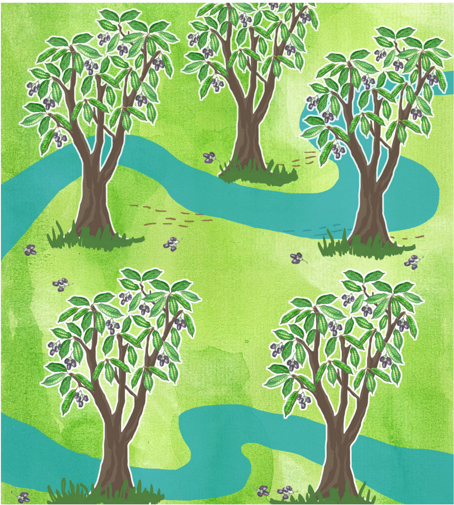
FIVE Jamun trees near a winding stream, Purple fruits littering the forest floor.