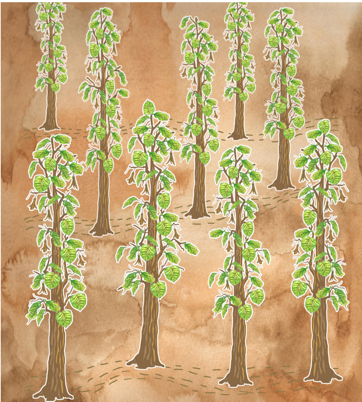
NINE Sal trees in a thick forest, Leathery leaves for making serving plates.