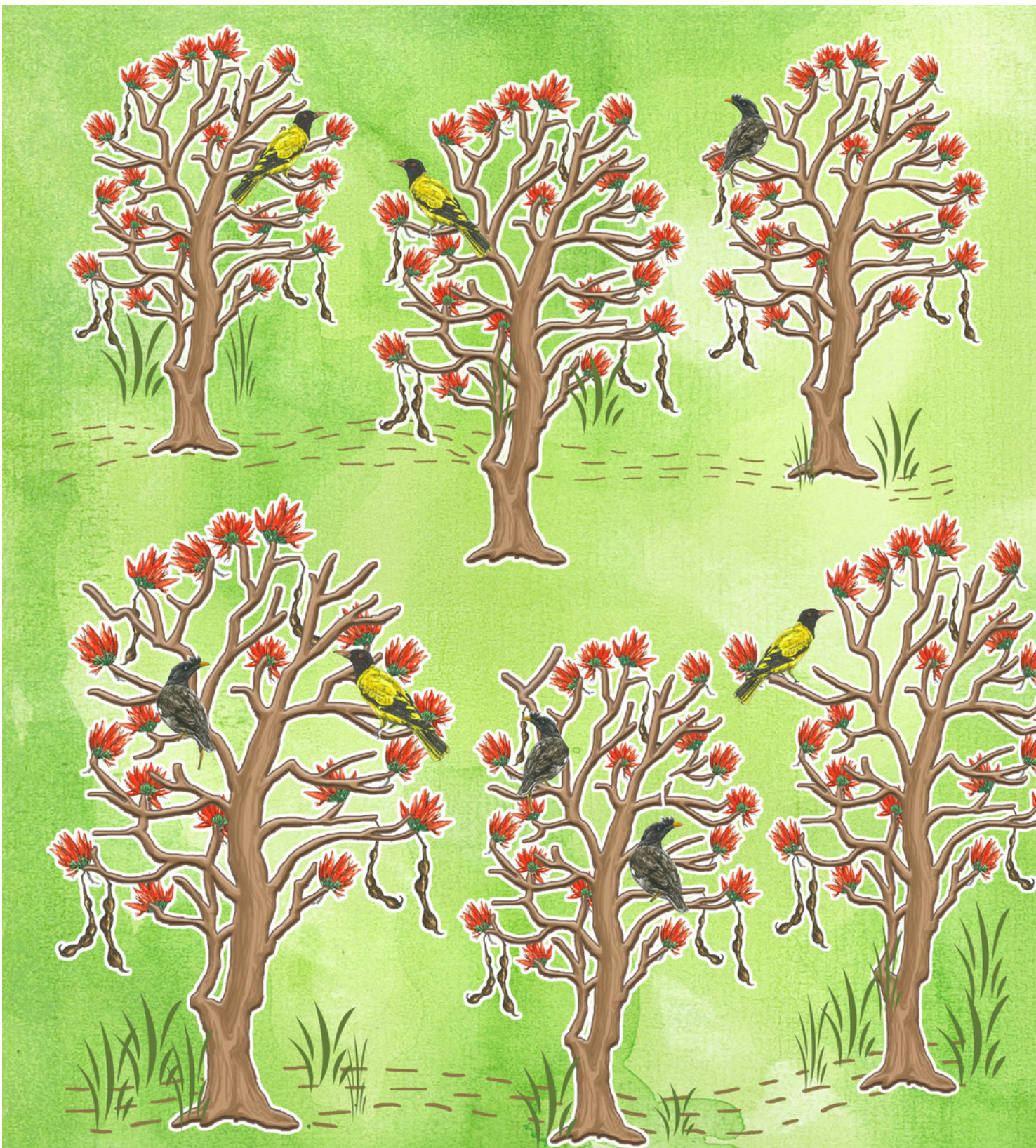
SIX Coral trees beside a farmland, Crimson blossoms to attract many birds.